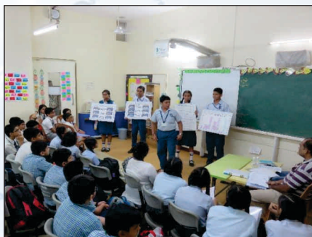
National Children's Science Congress: Project presentation by student Team