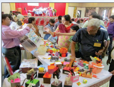
Science Utsav: Origami Demonstration and Workshop