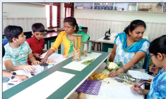
Homi Bhabha Bal Vaidnyanik Competition: A session in practicals