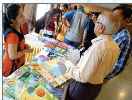
Science Books on Display at Science Utsav