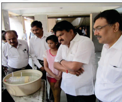
Science Utsav: Exhibition of Science Experiments