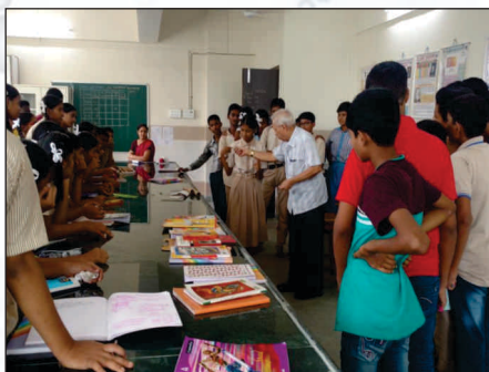
Fun with Science event at NMMC School no. 102 : Importance of 2 eyes