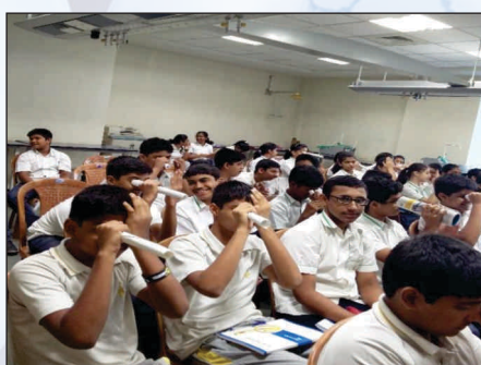
Students participating in Fun with science event