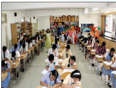
Students participation in essay competition: Nurturing talent for Nobel Laureatism