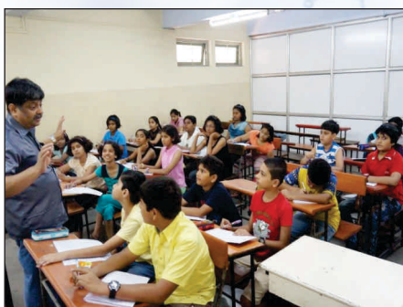
Science Nurture Club: Guidance Session