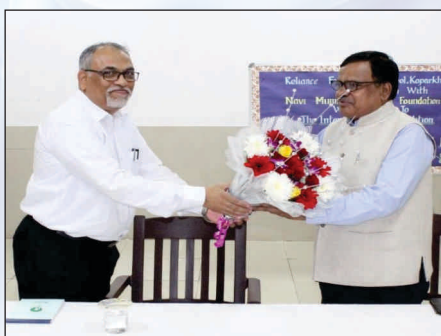
Essay Competition on "Nurturing Talent for Nobel Laureatism": Chief Guest being honoured